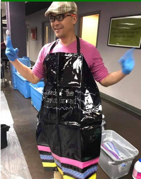
New Aprons at foot clinic from Compassionate Atlanta